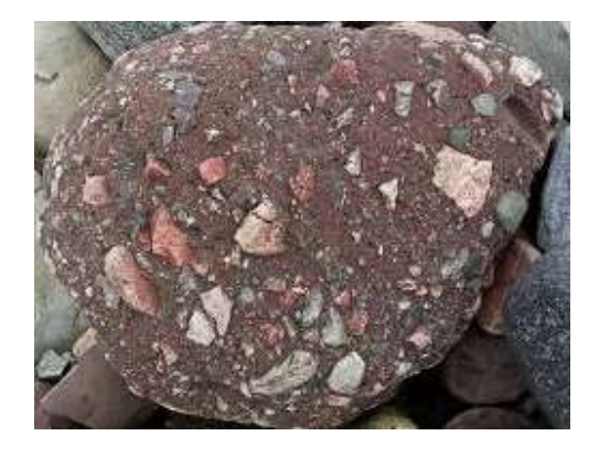
Here's a tillite from somewhere else...

Most probably a tillite but what's the deal with the parallel Fe-rich layers (presumably originally horizontal) being truncated by the larger clasts?